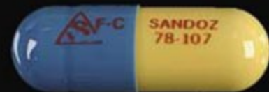
Fiorinal with codeine 30mg